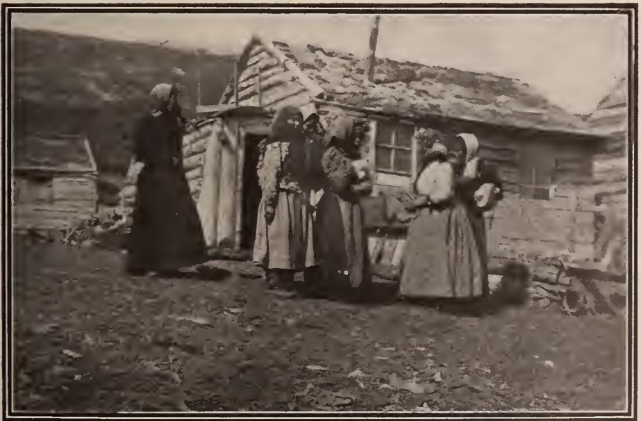
ESKIMOS OF NAIN, LABRADOR, IN EUROPEAN DRESS

Dr. Wilfred Grenfell has done much to make The Labrador known to the world as well as to bring the gospel of hope and health and joy and peace to the fisherfolk of Labrador. That part of Labrador which stretches north from Blanc Sablon is spoken of as Newfoundland Labrador, while that part that stretches southwest is the Canadian Labrador. Both these portions of the coast have been the scenes of Dr. Grenfell's work. The headquarters of this Labrador work is St. Anthony's, at the extreme northern part of Newfoundland. Here is a hospital, an orphanage and an in-